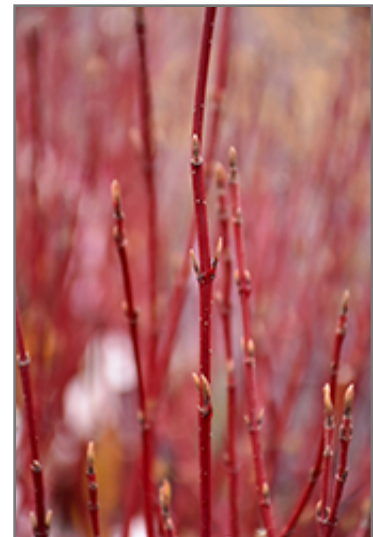
Tatarian Dogwood stems