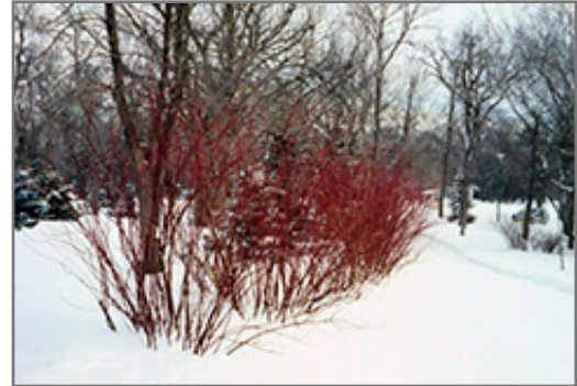
Tatarian Dogwood in winter