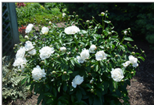
Festiva Maxima Peony in bloom