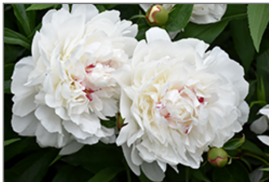
Festiva Maxima Peony flowers