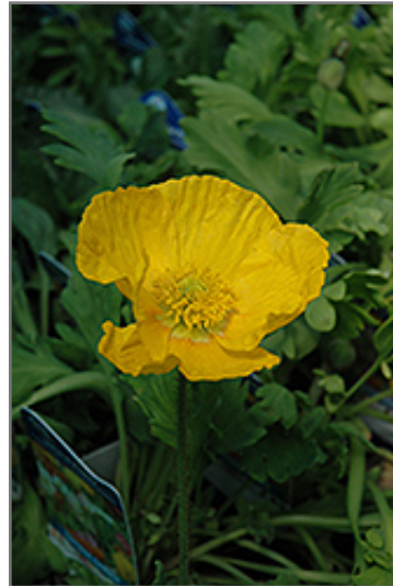
Garden Gnome Poppy flowers