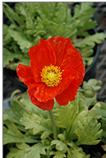
Garden Gnome Poppy flowers