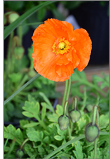
Garden Gnome Poppy flowers

This plant does best in full sun to partial shade. It prefers dry to average moisture levels with very well-drained soil, and will often die in standing water. It is not particular as to soil type or pH. It is somewhat tolerant of urban pollution, and will benefit from being planted in a relatively sheltered location. Consider covering it with a thick layer of mulch in winter to protect it in exposed locations or colder microclimates. This is a selection of a native North American species.