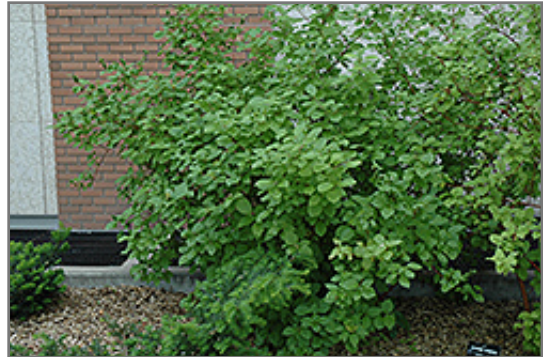
Siberian Dogwood