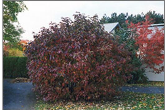
Siberian Dogwood in fall

This shrub does best in full sun to partial shade. It is an amazingly adaptable plant, tolerating both dry conditions and even some standing water. It is not particular as to soil type or pH. It is highly tolerant of urban pollution and will even thrive in inner city environments. This is a selected variety of a species not originally from North America.