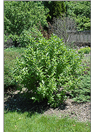
Arctic Fire Red Twig Dogwood