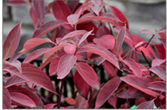
Arctic Fire Red Twig Dogwood in fall

This shrub does best in full sun to partial shade. It is an amazingly adaptable plant, tolerating both dry conditions and even some standing water. It is not particular as to soil type or pH. It is highly tolerant of urban pollution and will even thrive in inner city environments. This is a selection of a native North American species.