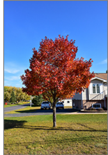
Northwood Red Maple in fall