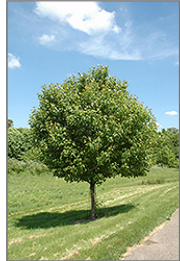
Northwood Red Maple

This tree should only be grown in full sunlight. It is quite adaptable, preferring to grow in average to wet conditions, and will even tolerate some standing water. It is not particular as to soil type, but has a definite preference for acidic soils, and is subject to chlorosis (yellowing) of the foliage in alkaline soils. It is somewhat tolerant of urban pollution. This is a selection of a native North American species.