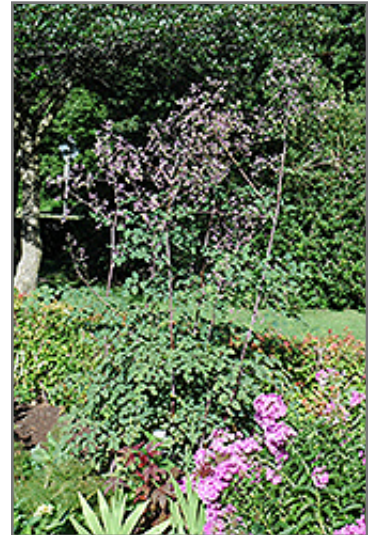
Rochebrun Meadow Rue in bloom