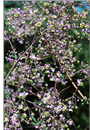
Rochebrun Meadow Rue flowers