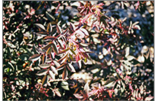
Red Leaf Rose foliage

This shrub should only be grown in full sunlight. It does best in average to evenly moist conditions, but will not tolerate standing water. It is not particular as to soil type or pH. It is highly tolerant of urban pollution and will even thrive in inner city environments. This species is not originally from North America.