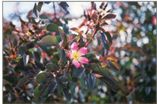
Red Leaf Rose flowers