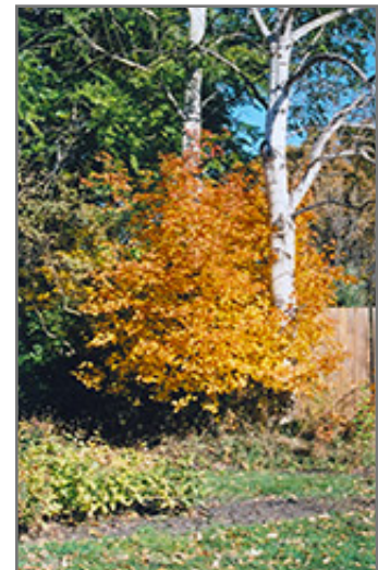
Saskatoon in fall