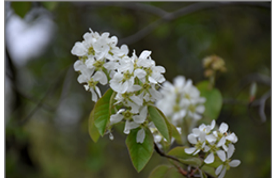
Saskatoon flowers

Saskatoon is a multi-stemmed deciduous shrub with an upright spreading habit of growth. Its relatively fine texture sets it apart from other landscape plants with less refined foliage.