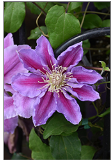
Bees' Jubilee Clematis flowers