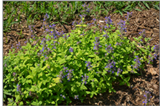
Chartreuse On The Loose Catmint in bloom