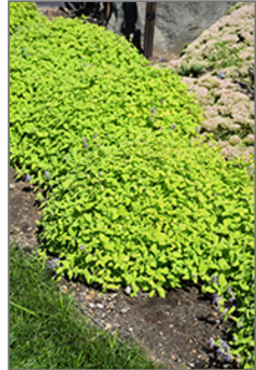
Chartreuse On The Loose Catmint