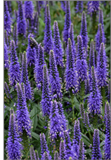
Skyward Blue Long-leaf Speedwell flowers

Skyward Blue Long-leaf Speedwell is recommended for the following landscape applications;