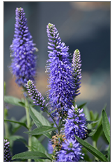
Skyward Blue Long-leaf Speedwell flowers

Skyward Blue Long-leaf Speedwell is a fine choice for the garden, but it is also a good selection for planting in outdoor pots and containers. It is often used as a 'filler' in the 'spiller-thriller-filler' container combination, providing a mass of flowers against which the larger thriller plants stand out. Note that when growing plants in outdoor containers and baskets, they may require more frequent waterings than they would in the yard or garden. Be aware that in our climate, most plants cannot be expected to survive the winter if left in containers outdoors, and this plant is no exception. Contact our experts for more information on how to protect it over the winter months.