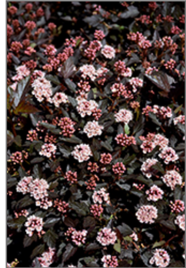
Little Joker Ninebark flowers