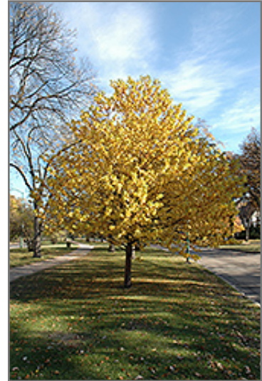
Amur Cherry in fall

This tree should only be grown in full sunlight. It does best in average to evenly moist conditions, but will not tolerate standing water. It is not particular as to soil type or pH. It is somewhat tolerant of urban pollution. This species is not originally from North America.