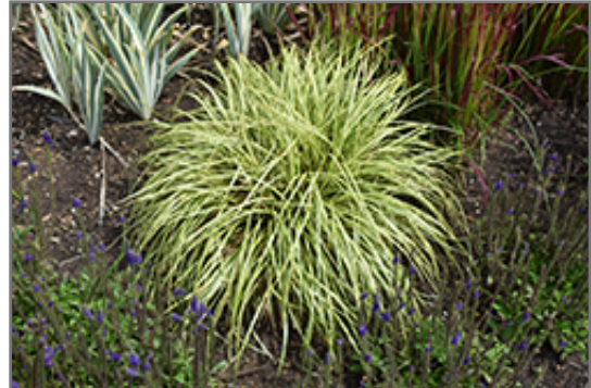
Evergold Variegated Japanese Sedge foliage

Evergold Variegated Japanese Sedge is recommended for the following landscape applications;