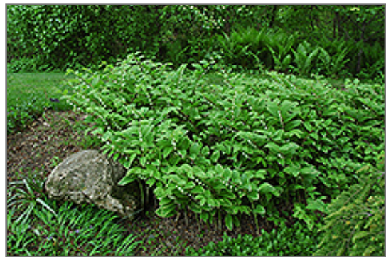
Variegated Solomon's Seal in bloom