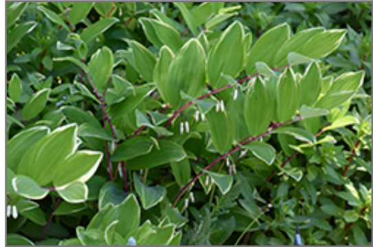
Variegated Solomon's Seal flowers