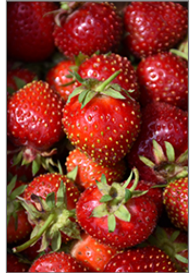
Eversweet Strawberry fruit

Eversweet Strawberry features dainty white cup-shaped flowers with yellow eyes at the ends of the stems from late spring to late summer. Its serrated round compound leaves remain dark green in colour throughout the season. It features an abundance of magnificent red berries from late spring to early fall.