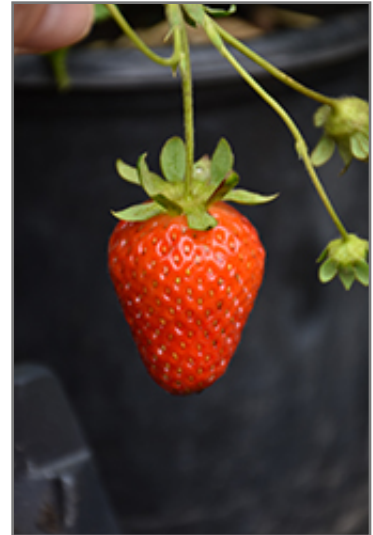
Eversweet Strawberry fruit