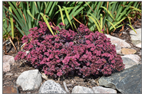
Dream Dazzler Stonecrop in bloom