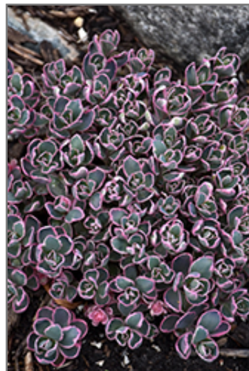
Dream Dazzler Stonecrop foliage

Dream Dazzler Stonecrop is a dense herbaceous perennial with an upright spreading habit of growth. Its medium texture blends into the garden, but can always be balanced by a couple of finer or coarser plants for an effective composition.