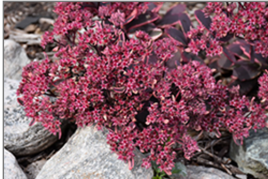
Dream Dazzler Stonecrop flowers