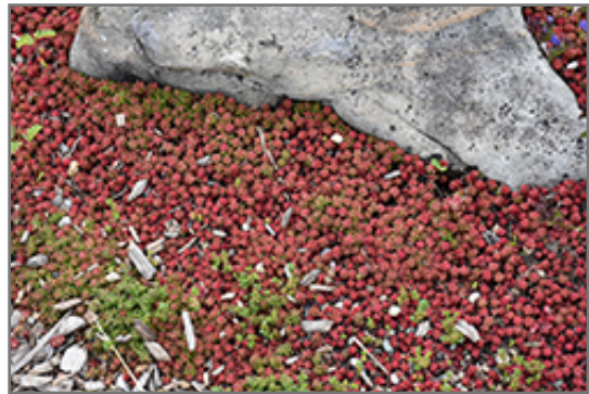
Coral Carpet Stonecrop

Coral Carpet Stonecrop is a dense herbaceous evergreen perennial with a ground-hugging habit of growth. Its medium texture blends into the garden, but can always be balanced by a couple of finer or coarser plants for an effective composition.