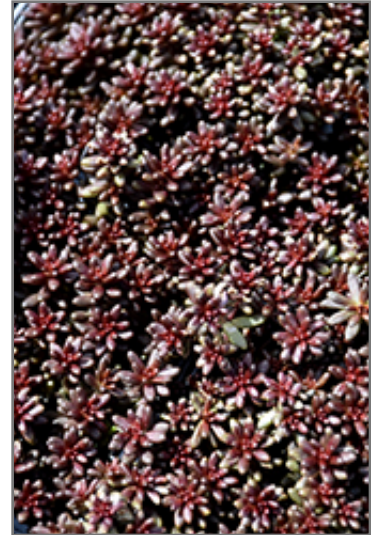
Coral Carpet Stonecrop

Coral Carpet Stonecrop is a fine choice for the garden, but it is also a good selection for planting in outdoor pots and containers. Because of its spreading habit of growth, it is ideally suited for use as a 'spiller' in the 'spiller-thriller-filler' container combination; plant it near the edges where it can spill gracefully over the pot. Note that when growing plants in outdoor containers and baskets, they may require more frequent waterings than they would in the yard or garden. Be aware that in our climate, most plants cannot be expected to survive the winter if left in containers outdoors, and this plant is no exception. Contact our experts for more information on how to protect it over the winter months.