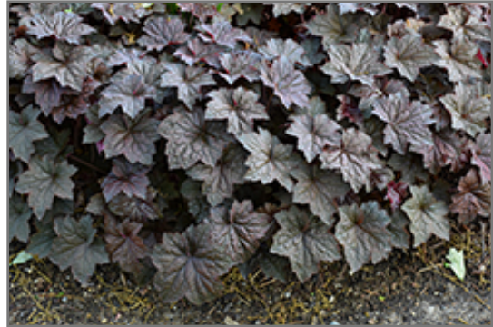
Palace Purple Coral Bells

Palace Purple Coral Bells will grow to be about 12 inches tall at maturity extending to 24 inches tall with the flowers, with a spread of 12 inches. When grown in masses or used as a bedding plant, individual plants should be spaced approximately 10 inches apart. Its foliage tends to remain dense right to the ground, not requiring facer plants in front. It grows at a medium rate, and under ideal conditions can be expected to live for approximately 10 years. As an evergreen perennial, this plant will typically keep its form and foliage year-round.