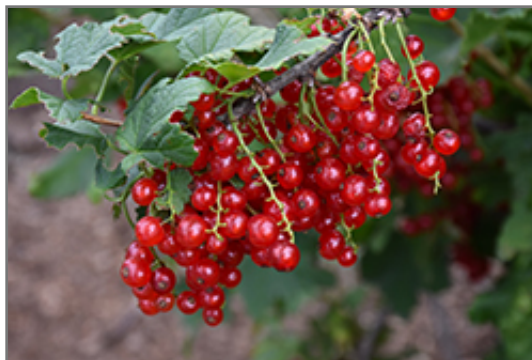
Red Currant fruit

Aside from its primary use as an edible, Red Currant is suitable for the following landscape applications;