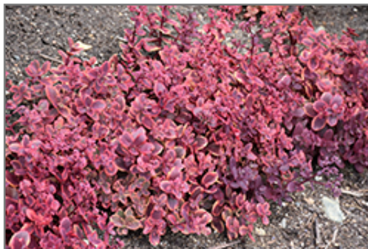
Sunsparkler Wildfire Stonecrop