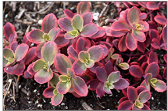
Sunsparkler Wildfire Stonecrop foliage