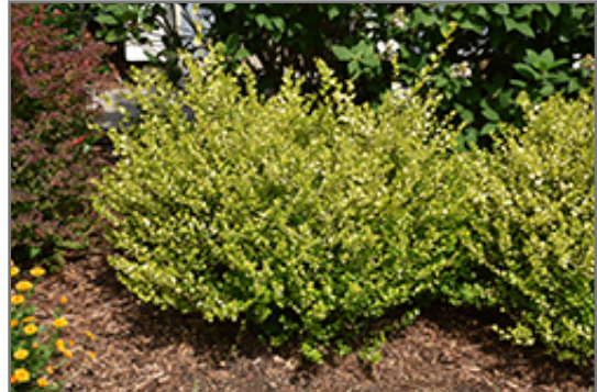
Cesky Gold Dwarf Birch