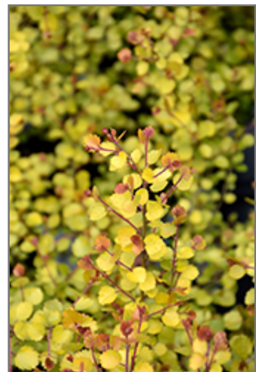
Cesky Gold Dwarf Birch foliage