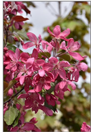
Royal Mist Flowering Crab flowers