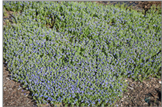
Tidal Pool Speedwell in bloom