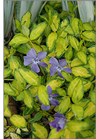
Illumination Periwinkle flowers

Illumination Periwinkle is a fine choice for the garden, but it is also a good selection for planting in outdoor pots and containers. Because of its spreading habit of growth, it is ideally suited for use as a 'spiller' in the 'spiller-thriller-filler' container combination; plant it near the edges where it can spill gracefully over the pot. Note that when growing plants in outdoor containers and baskets, they may require more frequent waterings than they would in the yard or garden. Be aware that in our climate, most plants cannot be expected to survive the winter if left in containers outdoors, and this plant is no exception. Contact our experts for more information on how to protect it over the winter months.