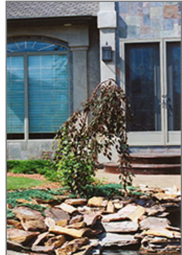
Royal Beauty Flowering Crab