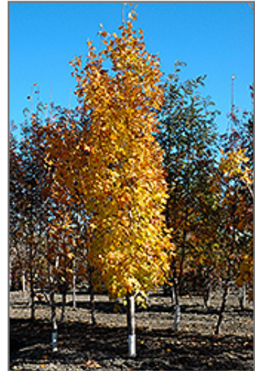
Lord Selkirk Sugar Maple in fall