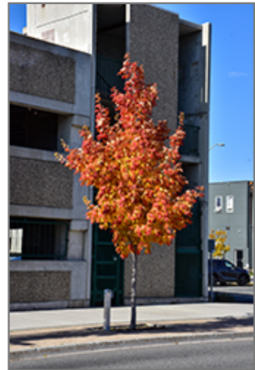
Lord Selkirk Sugar Maple in fall