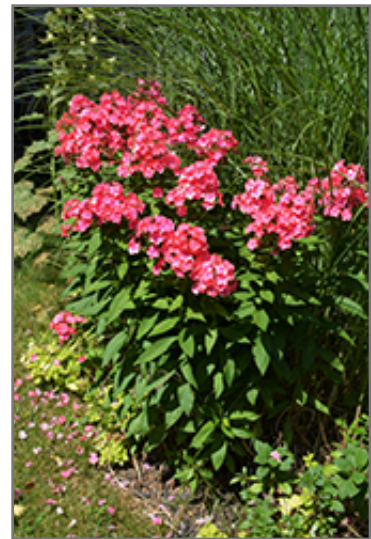
Flame Coral Garden Phlox in bloom