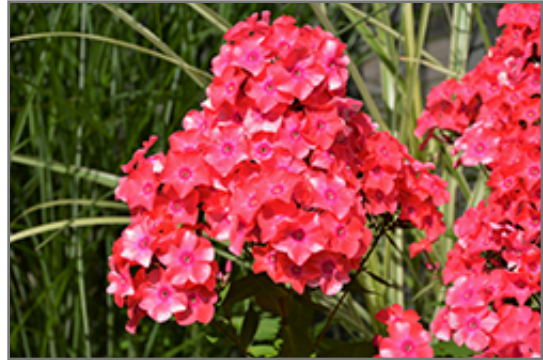
Flame Coral Garden Phlox flowers