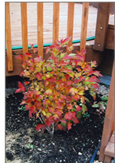
Compact Highbush Cranberry in fall