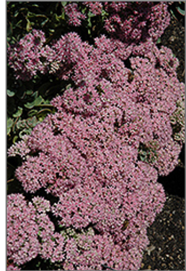
Lime Zinger Stonecrop flowers

This is a relatively low maintenance plant, and is best cleaned up in early spring before it resumes active growth for the season. It is a good choice for attracting bees and butterflies to your yard, but is not particularly attractive to deer who tend to leave it alone in favor of tastier treats. It has no significant negative characteristics.