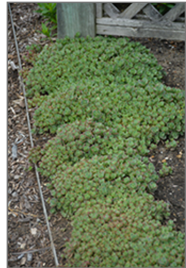
Lime Zinger Stonecrop

Lime Zinger Stonecrop will grow to be only 4 inches tall at maturity extending to 6 inches tall with the flowers, with a spread of 18 inches. When grown in masses or used as a bedding plant, individual plants should be spaced approximately 15 inches apart. Its foliage tends to remain low and dense right to the ground. It grows at a fast rate, and under ideal conditions can be expected to live for approximately 15 years. As an herbaceous perennial, this plant will usually die back to the crown each winter, and will regrow from the base each spring. Be careful not to disturb the crown in late winter when it may not be readily seen!