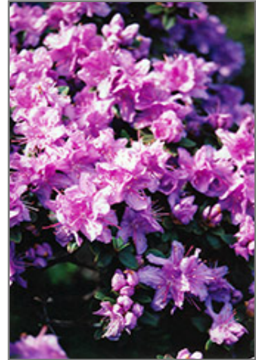
Ramapo Rhododendron flowers

Ramapo Rhododendron will grow to be about 3 feet tall at maturity, with a spread of 3 feet. It has a low canopy. It grows at a slow rate, and under ideal conditions can be expected to live for 40 years or more.