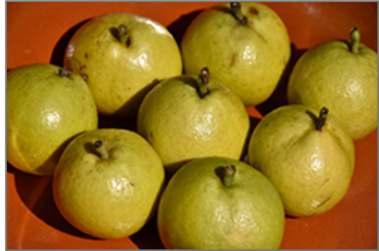
Golden Spice Pear fruit