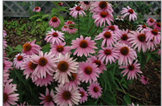
Magnus Superior Coneflower flowers