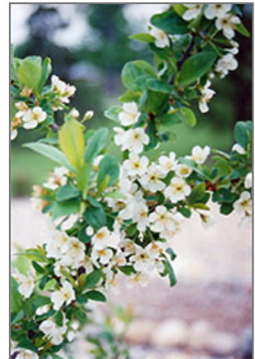
Opata Cherry-Plum flowers