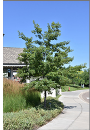
Majestic Skies Northern Pin Oak