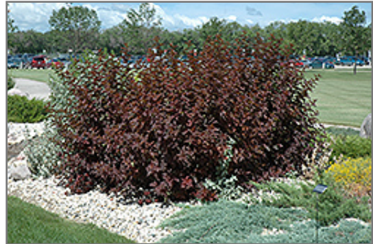
Diablo Ninebark