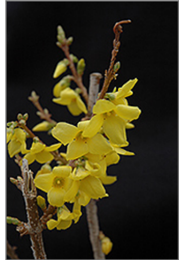
Show Off Forsythia flowers

Show Off Forsythia makes a fine choice for the outdoor landscape, but it is also well-suited for use in outdoor pots and containers. With its upright habit of growth, it is best suited for use as a 'thriller' in the 'spiller-thriller-filler' container combination; plant it near the center of the pot, surrounded by smaller plants and those that spill over the edges. It is even sizeable enough that it can be grown alone in a suitable container. Note that when grown in a container, it may not perform exactly as indicated on the tag - this is to be expected. Also note that when growing plants in outdoor containers and baskets, they may require more frequent waterings than they would in the yard or garden. Be aware that in our climate, most plants cannot be expected to survive the winter if left in containers outdoors, and this plant is no exception. Contact our experts for more information on how to protect it over the winter months.