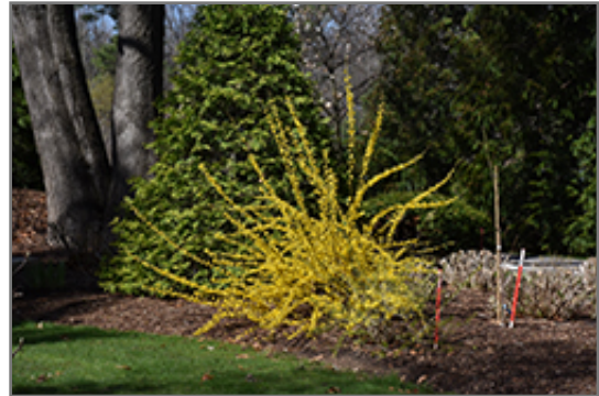
Show Off Forsythia in bloom