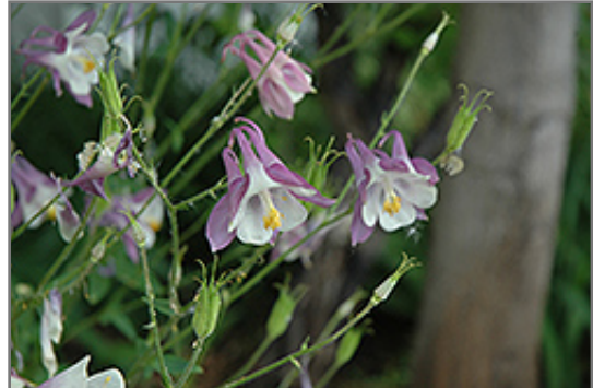
Common Columbine flowers