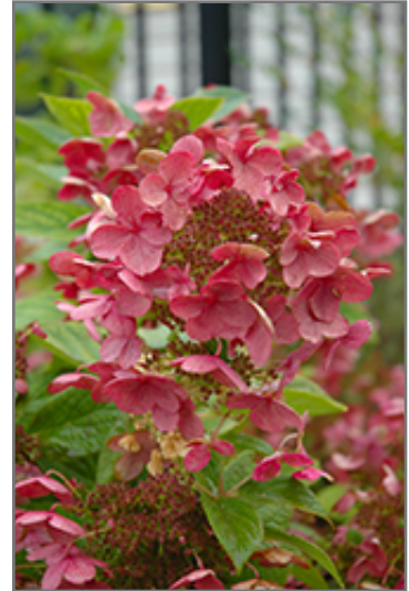
Quick Fire Hydrangea flowers (faded)

This shrub performs well in both full sun and full shade. It prefers to grow in average to moist conditions, and shouldn't be allowed to dry out. It is not particular as to soil type or pH. It is highly tolerant of urban pollution and will even thrive in inner city environments. Consider applying a thick mulch around the root zone in winter to protect it in exposed locations or colder microclimates. This is a selected variety of a species not originally from North America.