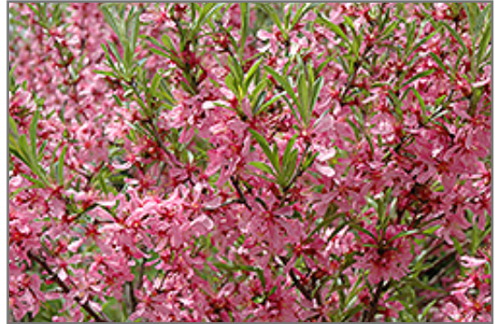
Russian Almond flowers