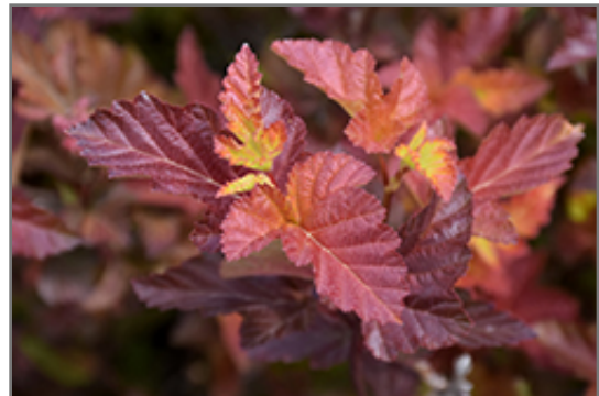
Center Glow Ninebark foliage

Center Glow Ninebark is recommended for the following landscape applications;