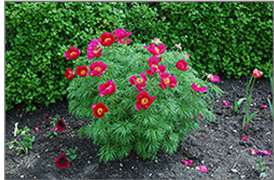
Fernleaf Peony in bloom