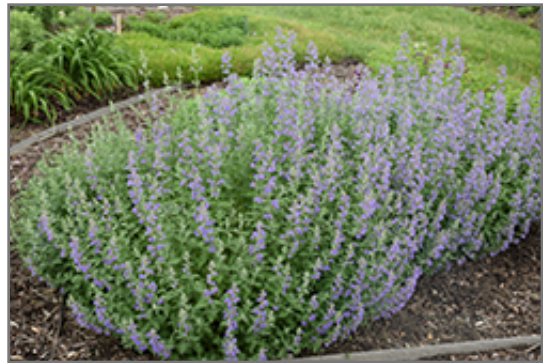
Walker's Low Catmint in bloom