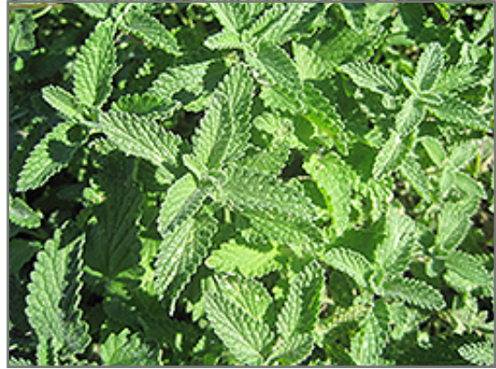
Walker's Low Catmint foliage

Walker's Low Catmint is a fine choice for the garden, but it is also a good selection for planting in outdoor pots and containers. It is often used as a 'filler' in the 'spiller-thriller-filler' container combination, providing a mass of flowers against which the thriller plants stand out. Note that when growing plants in outdoor containers and baskets, they may require more frequent waterings than they would in the yard or garden. Be aware that in our climate, most plants cannot be expected to survive the winter if left in containers outdoors, and this plant is no exception. Contact our experts for more information on how to protect it over the winter months.