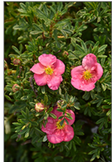
Bella Bellissima Potentilla flowers