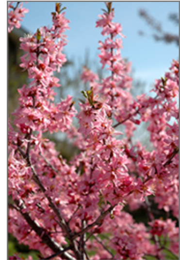
Muckle Plum flowers