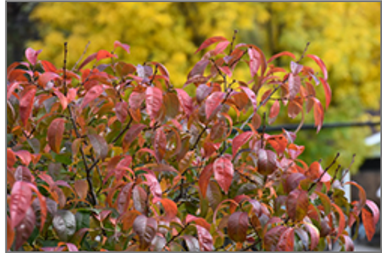
Muckle Plum in fall

This shrub should only be grown in full sunlight. It does best in average to evenly moist conditions, but will not tolerate standing water. It is not particular as to soil type or pH. It is highly tolerant of urban pollution and will even thrive in inner city environments. This particular variety is an interspecific hybrid.