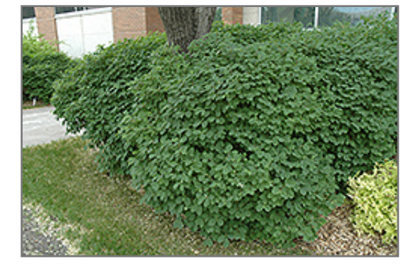
Miniglobe Honeysuckle