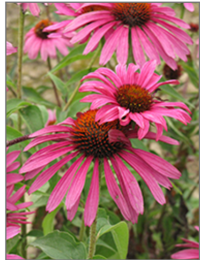
Ruby Star Coneflower flowers