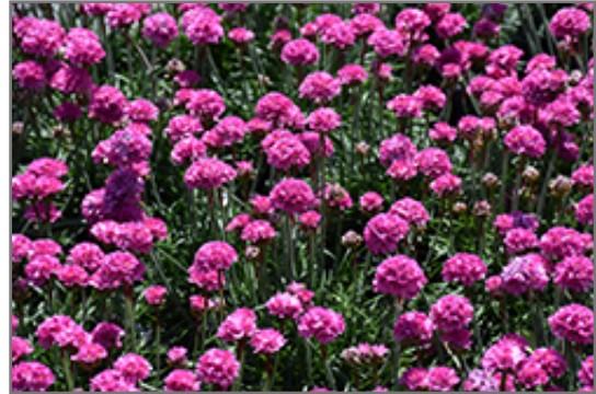
Dusseldorf Pride Sea Thrift flowers

Dusseldorf Pride Sea Thrift will grow to be only 6 inches tall at maturity extending to 8 inches tall with the flowers, with a spread of 8 inches. Its foliage tends to remain low and dense right to the ground. It grows at a slow rate, and under ideal conditions can be expected to live for approximately 10 years. As an evergreen perennial, this plant will typically keep its form and foliage year-round.