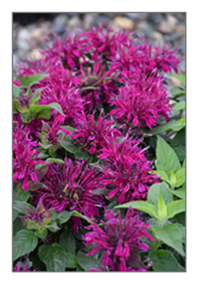
Balmy Purple Beebalm flowers