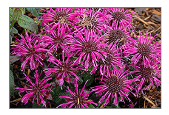
Balmy Purple Beebalm flowers (faded)